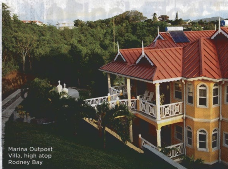
Marina Outpost Villa, high atop Rodney Bay

LOVE POTION The island has its own aphrodisiac, a juicy pear-like fruit known as the pomme d'amour , or love apple. Dasheene , an open-air restaurant in the hills of Soufrière, serves a delicious pomme d'amour daiquiri (866/290-0978, $8).