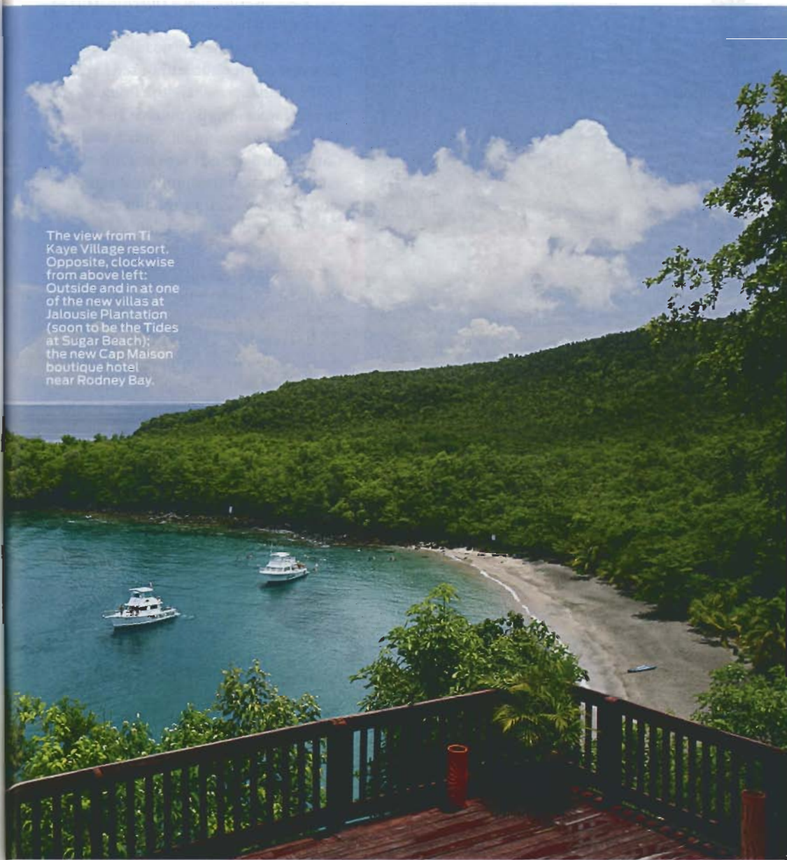
The view from Ti Kaye Village resort. Opposite, clockwise from above left: Outside and in at one of the new villas at Jalousie Plantation (soon to be the Tides at Sugar Beach); the new Cap Maison boutique hotel near Rodney Bay.

GETTING THERE While many Caribbean destinations are suffering from canceled or suspended air services, St. Lucia is an exception. JetBlue has just inaugurated nonstops three times a week to the island's Hewanorra airport from its spacious and efficient terminal at New York's JFK. — Ian Keown